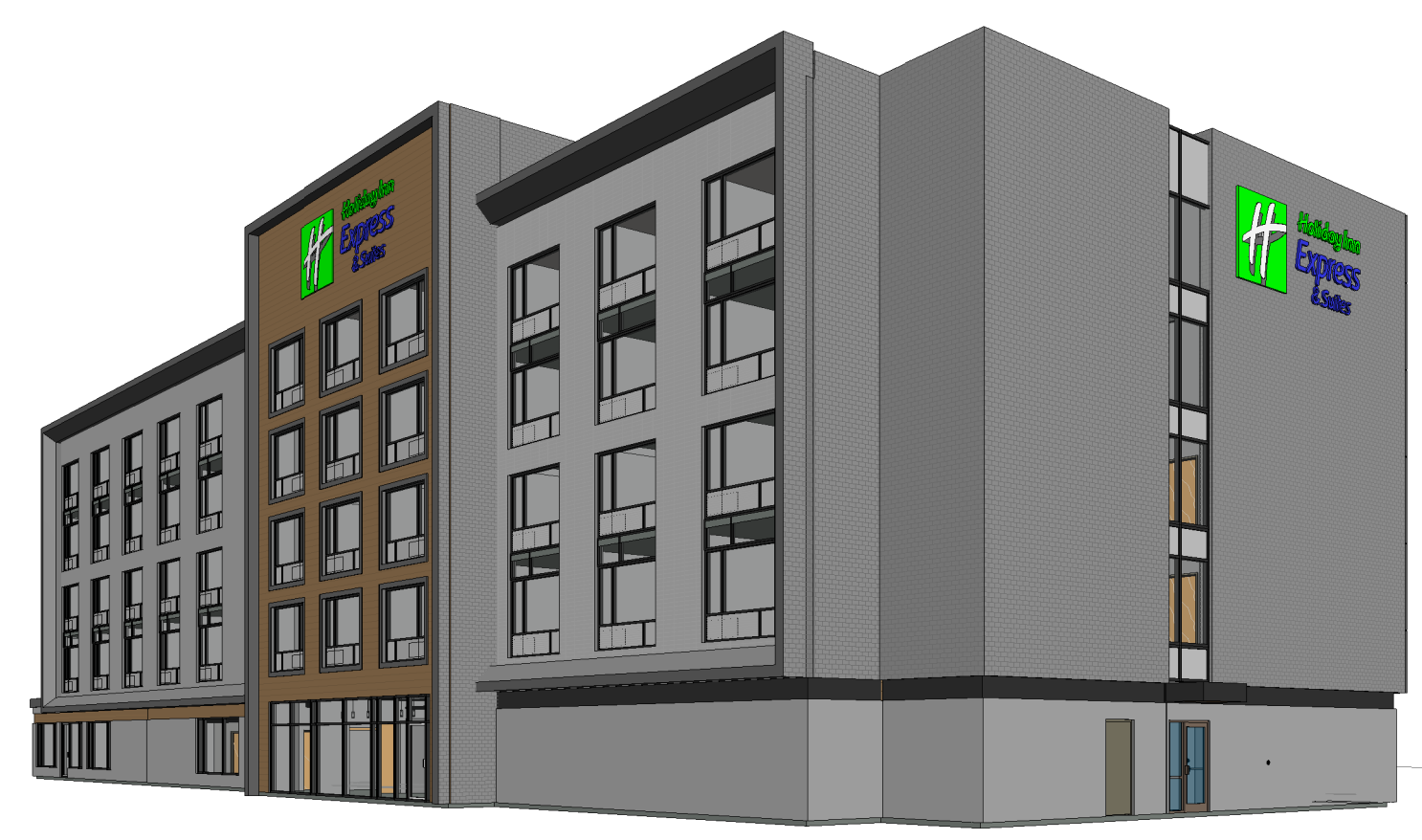
3 SOUTH-EAST VIEW A200