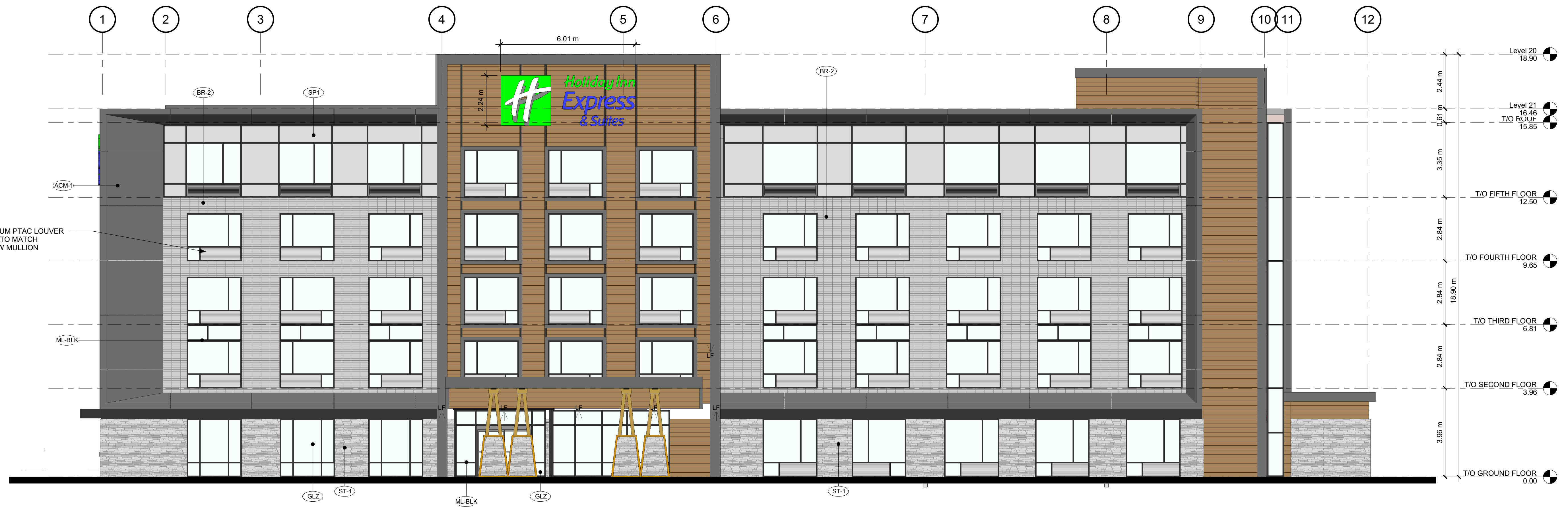
2 NORTH ELEVATION A200 1 : 96