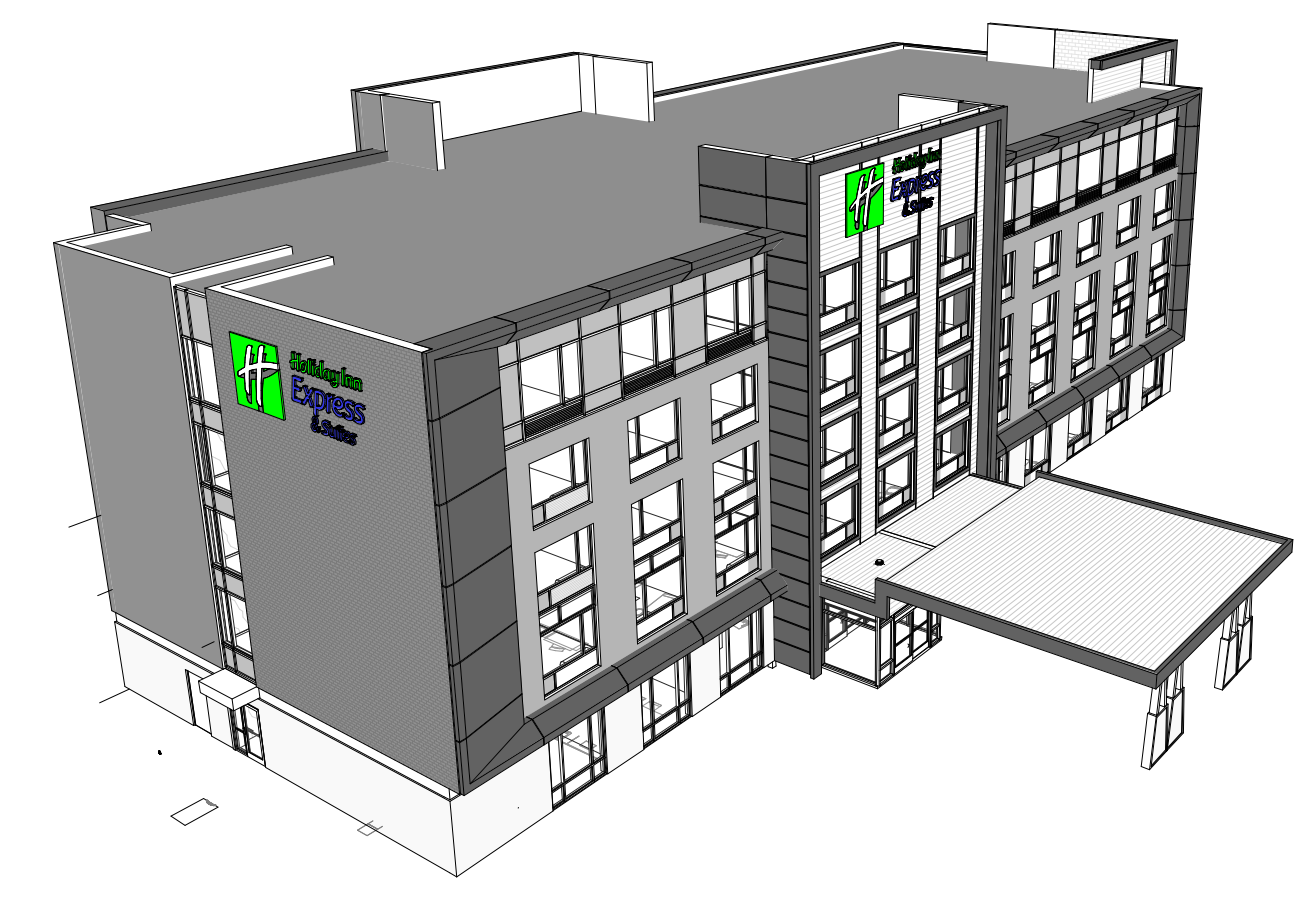
4 NORTH-EAST TOP VIEW A200