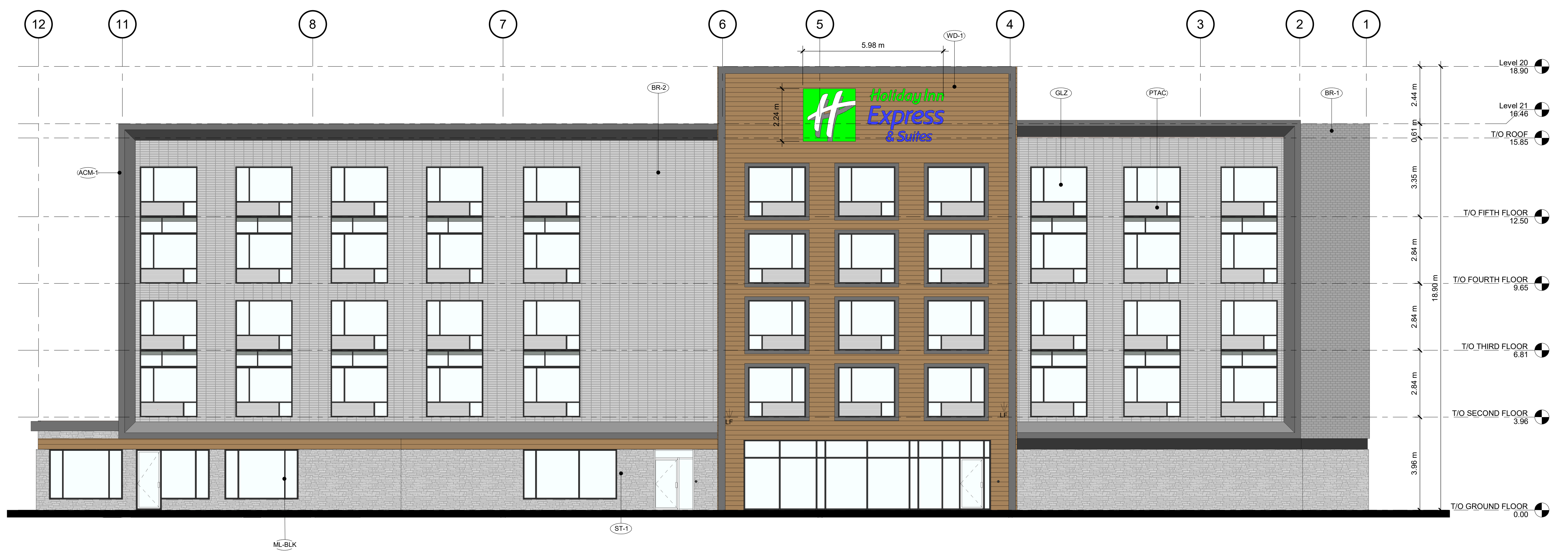
2 SOUTH ELEVATION A201 1 : 96

DO NOT SCALE DRAWINGS. USE ONLY DRAWINGS MARKED "ISSUED FOR CONSTRUCTION". VERIFY CONFIGURATIONS AND DIMENSIONS ON SITE BEFORE BEGINNING WORK. NOTIFY ARCHITECT IMMEDIATELY OF ANY ERRORS, OMISSIONS OR DISCREPANCIES. CHAMBERLAIN ARCHITECT SERVICES LIMITED AND CHAMBERLAIN CONSTRUCTION SERVICES LIMITED HAVE SIMILAR OWNERSHIP. CLIENT