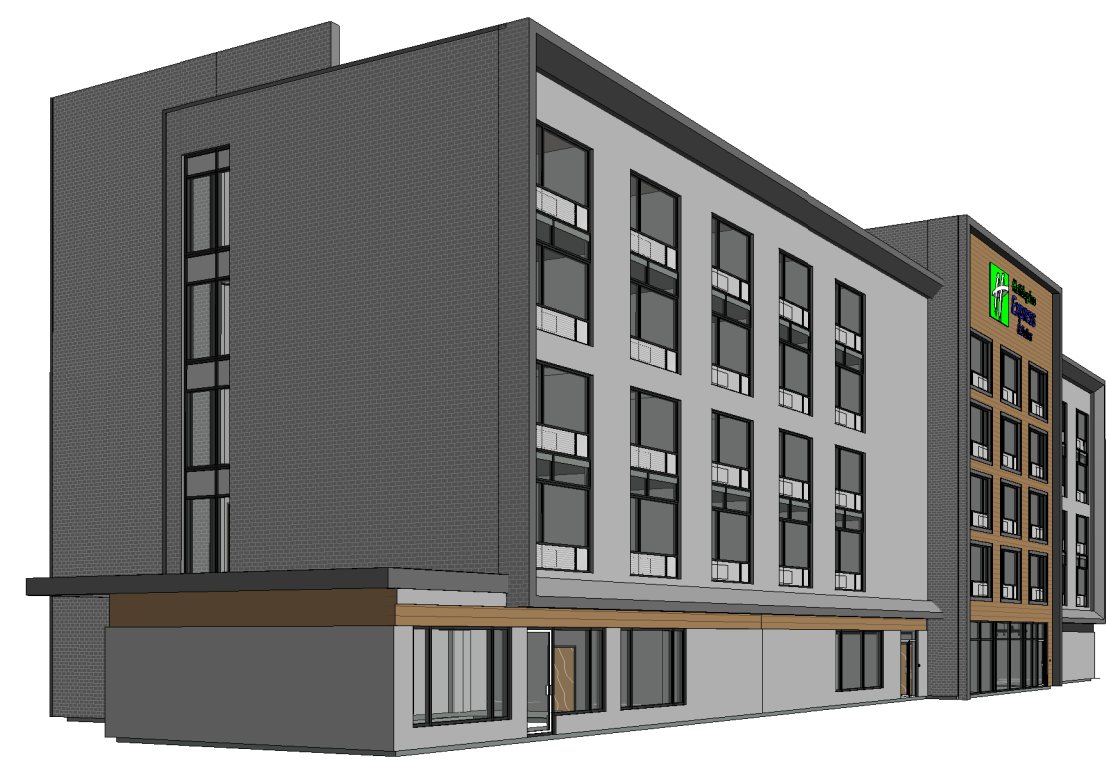
5 SOUTH-WEST. VIEW A201