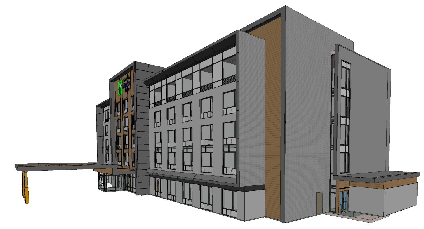
3 NORTH-WEST VIEW A201