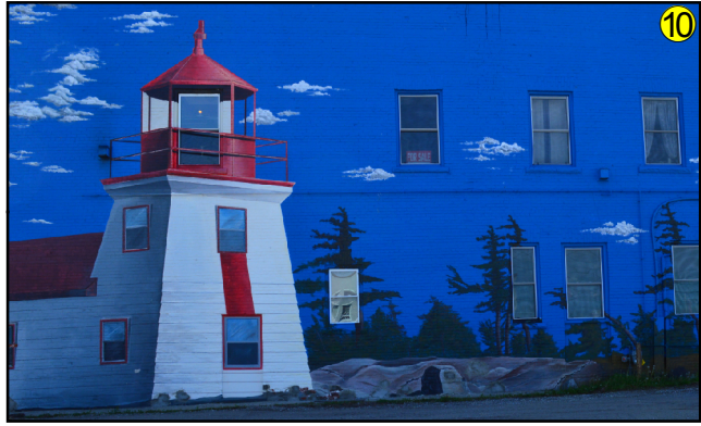
10. Brebeuf Lighthouse - Built in the 1900's to help guide ships on course from Giant's Tomb to the channel serving Midland Bay.