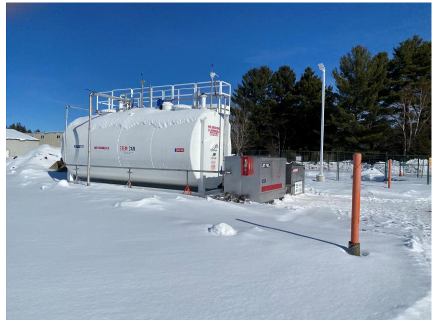
10 Electrically Serviced Hangar Lots (costs recoverable) High Volume Above Ground Fuel System